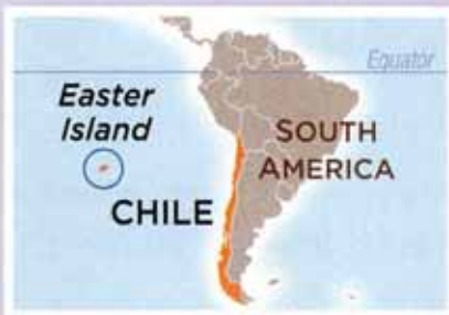
Easter Island is located in the South Pacific Ocean