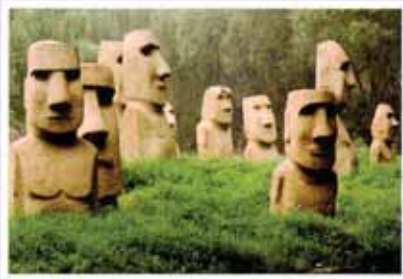
More moai heads