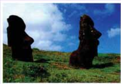
Moai heads on Easter Island